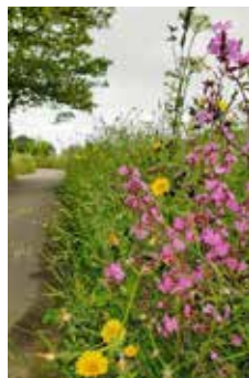
Sensitive management enables a diversity of species to flourish

Although the main aim of grass banque management is to maintain access along adjacent roads and paths, sensitive management will also create and maintain a diverse vegetation type and structure to support as many different species as possible. Roadside verge and banque management is similar to the management of meadows and other permanent grasslands, which are often very species rich.