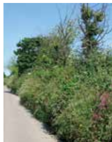
Hedges and banques are a haven for wildlife, prevent soil erosion and alleviate water pollution.

Using an inappropriate working practice can have a very negative impact on wildlife and the quality of the banque or hedge. This leaflet suggests the 'best working practices', whilst following the Law AND giving the maximum benefit to wildlife.