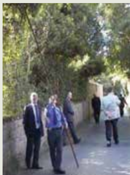
Roads Inspectors carrying out the twice yearly Visite du Branchage

The Law (Loi (1914) sur La Voirie) - literally, 'Law (1914) on the Road', is over one hundred years old. In accordance with the Law, Parish officials tour their parishes to ensure the Law has been observed. These 'Visite du Branchage' inspections take place every year in each parish in the three weeks from 24th June and 1st September. Under Article 41 of the Law, at least a week before the Visites, the Connétables publish a Notice in the Jersey Evening Post to inform their parishioners who occupy houses or who own lands bordering on public roads to cut back the growth along the edge of the public roads and footpaths. This includes all brambles, vegetation and other obstacles encroaching on the public road. A height of at least 12 feet (3.7 metres) must be kept above all public roads and 8 feet (2.4 metres) above footpaths.