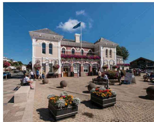
St. Brelade Parish Hall today

Funds are reserved for the project, but ongoing costs for the space are key drivers for the design. It is vital quality materials are specified for longevity. Whilst affection for the existing rowing boat (that serves as a seasonal planting container) are recognised, its annual upkeep draw thousands of pounds each year. New proposals seek to maintain the boat theme whilst working with quality materials to create a purposeful statement that has a robustness ensuring the installation will be a lasting feature within St. Aubin's landscape.