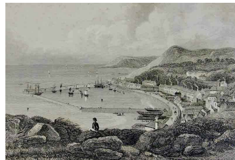
Painting of St. Aubin 19th Century